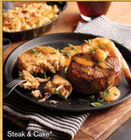
Steak & Cake*