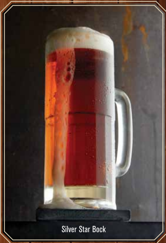
Silver Star Bock