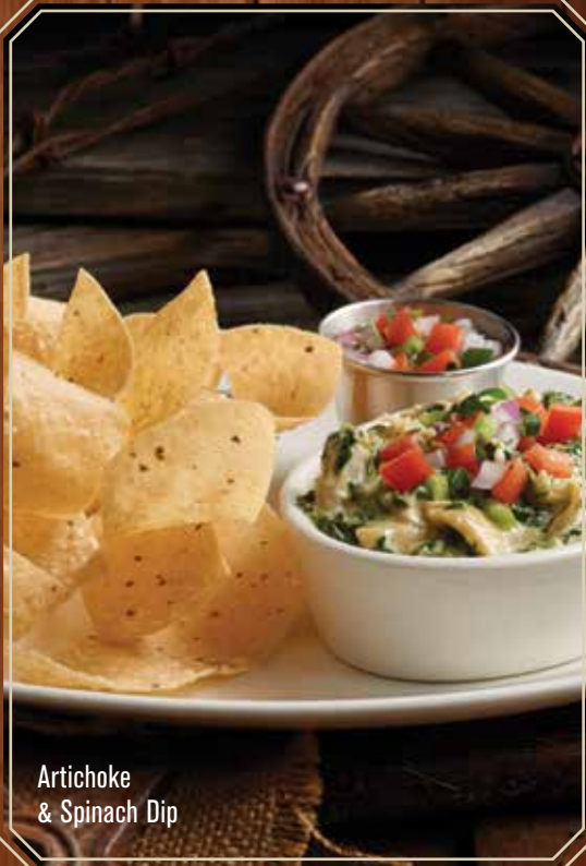
Artichoke & Spinach Dip