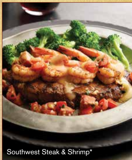
Southwest Steak & Shrimp*

(760-1110 cal)..... 8 oz. 23.99 Center-Cut Top Sirloin, choice of shrimp. 10 oz. 25.99