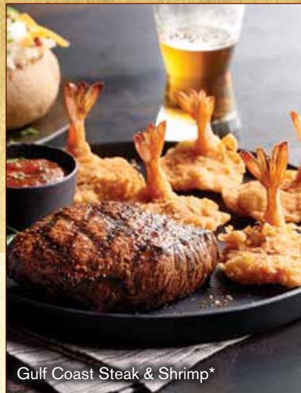
Gulf Coast Steak & Shrimp*