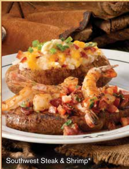
Southwest Steak & Shrimp*

All served with a side (add 120-660 cal) & your choice of Soup, Garden greens or Caesar salad (add 100-380 cal). Upgrade to a Wedge Salad or Spinach & Kale salad for 2.79 (add 450/340 cal).