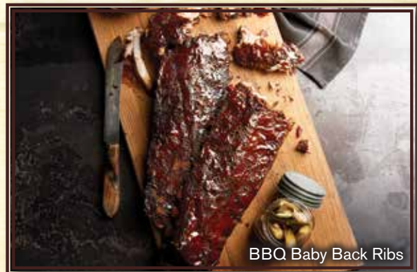
BBQ Baby Back Ribs

All served with a side (add 120-660 cal) and your choice of Soup, Garden greens or Caesar salad (add 100-380 cal). Upgrade to a Wedge or Spinach & Kale Salad for 2.79 (add 450/340 cal).