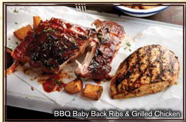
BBQ Baby Back Ribs & Grilled Chicken

All served with a side (add 120-660 cal) and your choice of Soup, Garden greens or Caesar salad (add 100-380 cal). Upgrade to a Wedge or Spinach & Kale salad (add 450/340 cal) for 2.99.