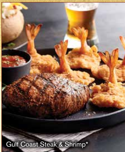
Gulf Coast Steak & Shrimp*