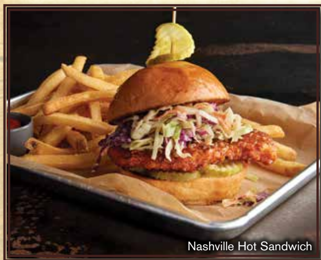
Nashville Hot Sandwich