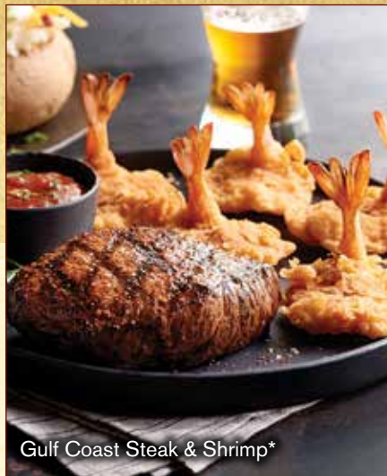
Gulf Coast Steak & Shrimp*