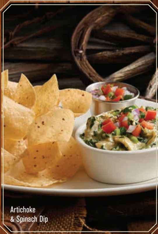
Artichoke & Spinach Dip