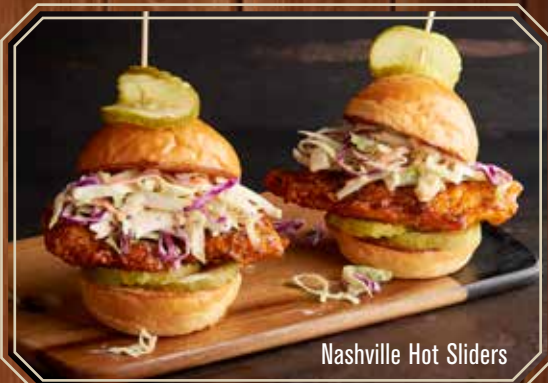
Nashville Hot Sliders